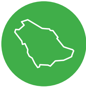
Relevant Government Agencies