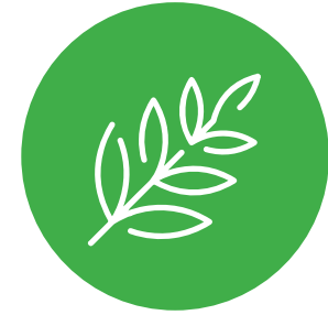
Algae Manufacturing Companies